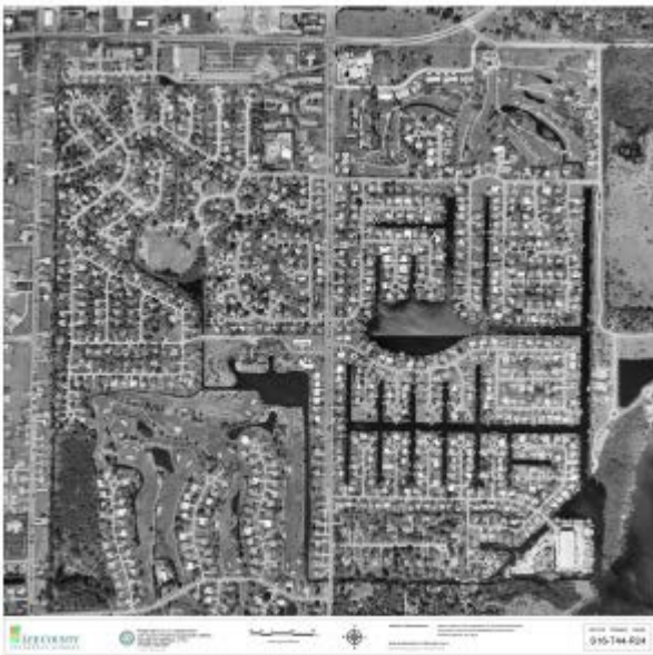
Black & White Aerial